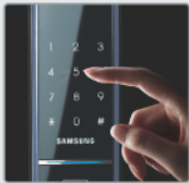
User Access Code