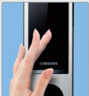
Press the wakeup button

Two(2) random numbers appear before you enter the user access code in order to stop copycat entries and prevent fingerprint tracing.