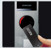
RF Key Tag