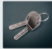
Mechanical Override Key