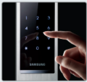
User Access Code