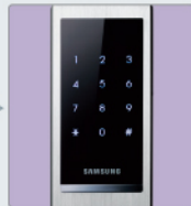
Keypad will display all numbers