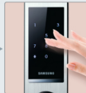
Enter your user access code