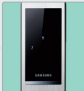
Press the displayed numbers in any order